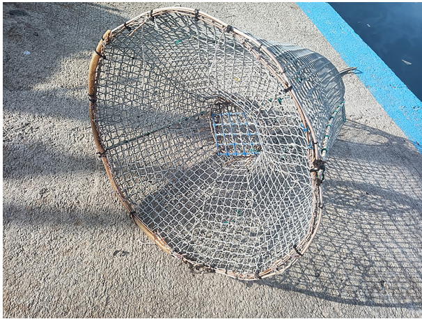
Figure 5. A closed basket trap which, in-situ , would prevent unnecessary cuttlefish deaths or ghost fishing mortality.

that existing indirect management measures (such as the octopus fisheries measures) may not be enough to curb the overexploitation status and that more direct management measures, such as a specific cuttlefish quota, and, as we suggest, further research into gear selectivity and an improved understanding of regional cuttlefish mortality, are essential for species recovery.