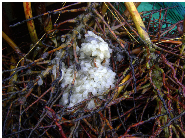
Figure 4. A fish aggregating device (FAD) constructed of casuarina branches with cuttlefish eggs attached.