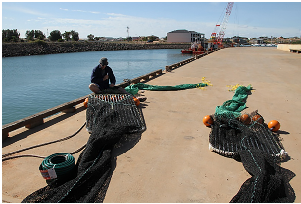
Figure 1. Nordmøre-grids designed to reduce bycatches of cuttlefish in penaeid trawls being assembled on a quayside.

speed of \sim 1.9 \text{ m s}^{-1} (Kennelly and Broadhurst, 2014; Noell et al. , 2018).