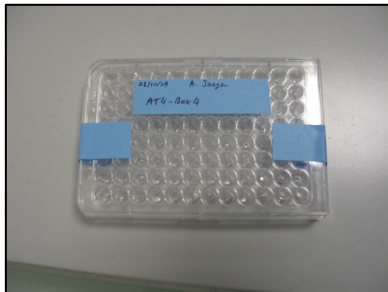
Fig.3. 96-well tray used for storage and shipping of the samples. Notice the 2 pieces of reusable tape to hold the cover and the one to note the identification information.

📌 Please do not write directly on the cover but on a piece of reusable laboratory tape! Trays are re-used after cleaning.