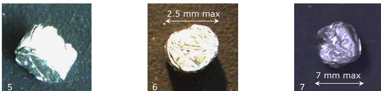
Fig. 2B. Examples of well packed capsules: 5-6) Small capsules (animals and plants); 7) Big capsule (sediment and filters).