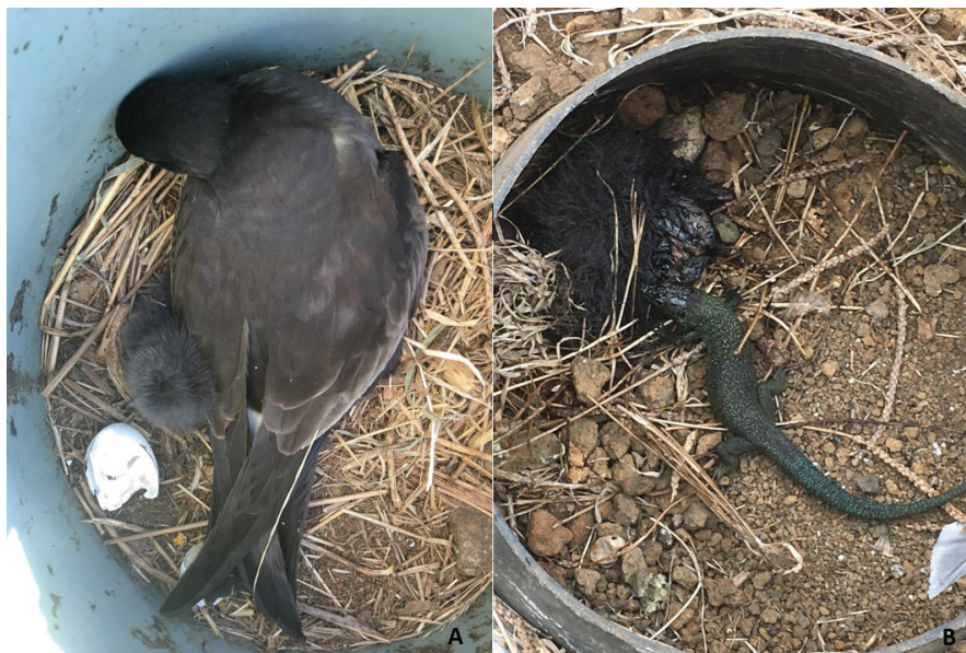
Figure 2. A. Monteiro’s storm-petrel Hydrobates monteiroi in an artificial nest at Praia Islet with a recently hatched chick and remnants of eggshell; B. Madeiran wall lizard Teira dugesii eating a chick of Monteiro’s storm-petrel in an artificial nest at Praia Islet.