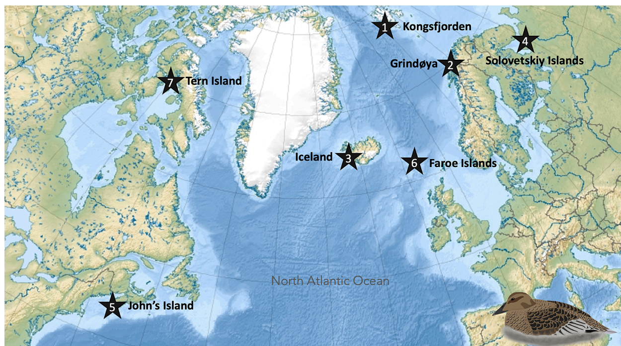
Fig. 1. Locations of the seven pan-Arctic and subarctic common eider colonies used in this study (stars). Colonies are numbered by descending median colony PRL levels (1 = highest, 7 = lowest). Map provided by naturalearthdata.com .

To examine whether PRL levels varied between colonies, we first ran an ANOVA followed by a posthoc Tukey's Honest Significant Difference (HSD) test using the R package car v.3.0-10 (Fox and Weisberg, 2019). We then used compact letter display, in combination with the R package ggplot2 v.3.3.6, to visually determine significance at an alpha level of 0.05 between the seven colonies using the R package multcompView v.0.1-8 (Graves et al., 2015; Wickham, 2016). Following this, we calculated AICc values for 12 potential models to determine the most parsimonious model using the R package AICcmodavg v.2.3-1 (Mazerolle, 2020). The model with the lowest AICc also had a significantly higher log-likelihood value, thus, was a better fit than the other models (Table 1). We then used a general linear mixed model (GLMM) with a normal distribution to determine the interactive effect of \delta^{15}\text{N} , \delta^{13}\text{C} and THg levels on PRL secretion. The dependent variable was PRL, with \delta^{15}\text{N} , \delta^{13}\text{C} and THg values included as fixed independent variables in all single, two- and three-way interactions. Additionally, we included female body mass (g) and clutch size as fixed independent variables in a two-way interaction. All independent variables were standardized and centred for comparison to remove misrepresentation of effects and